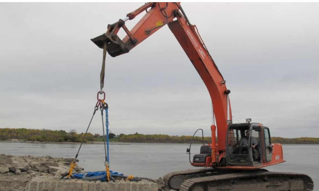
Design and Installation of granite anchors in fast flowing river