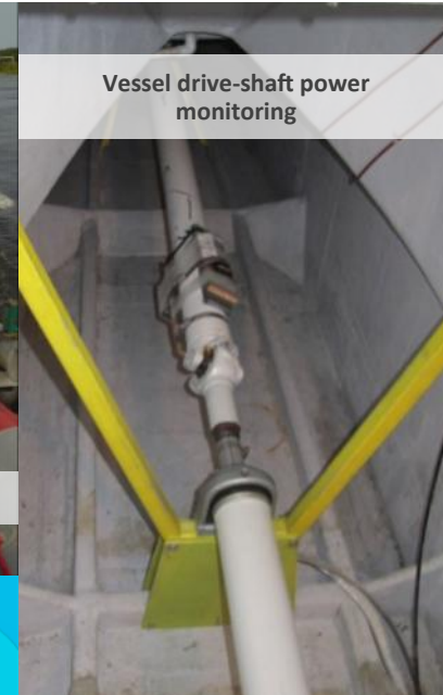
Vessel drive-shaft power monitoring