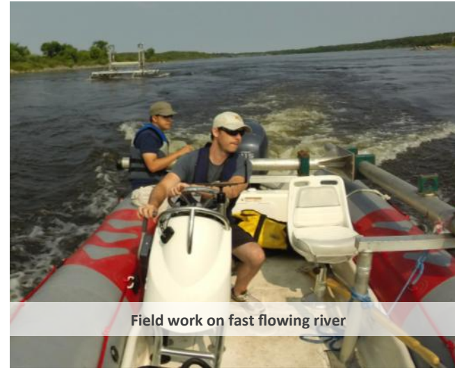
Field work on fast flowing river