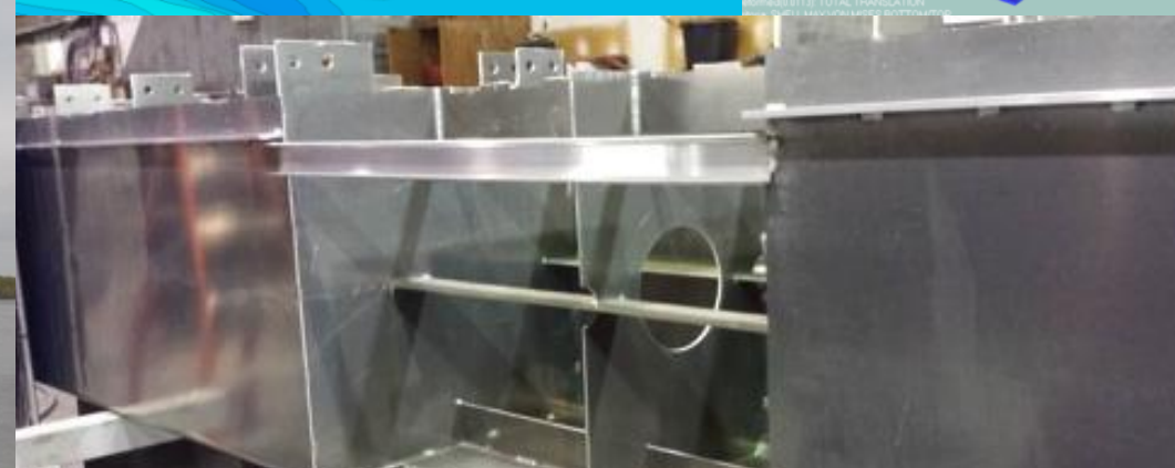
Catamaran hull design from concept through to fabrication